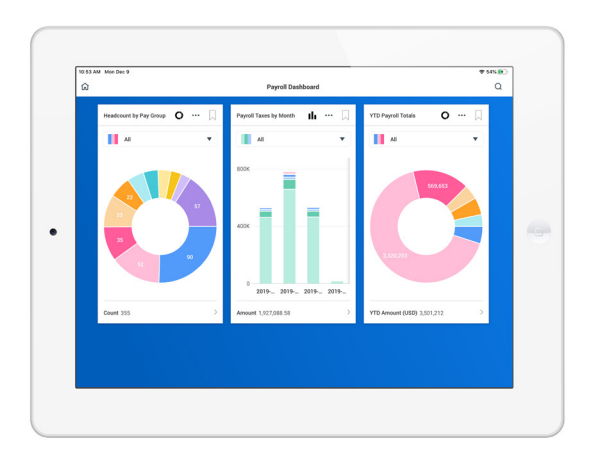
Run standard, prebuilt payroll reports or customise your own.

Workday Payroll for the US includes built-in analytics, allowing you to run reports and audits on all payroll data.